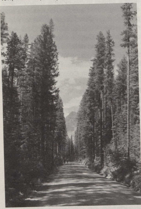
"Snow Peak Avenue" on the road to Emerald Lake in Yoho National Park.

Located 370 kilometres west of Edmonton, Alberta, Jasper is one of the largest