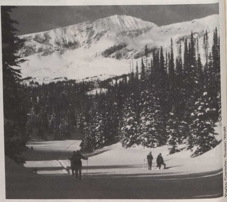
Cross-country skiing on one of the many trails in Banff National Park.