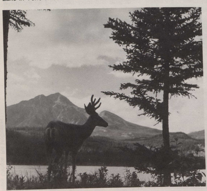
Lake Edith and Pyramid Mountain, in Jasper National Park.

Inside the northern entrance to the park along the Banff-Windermere Highway, are