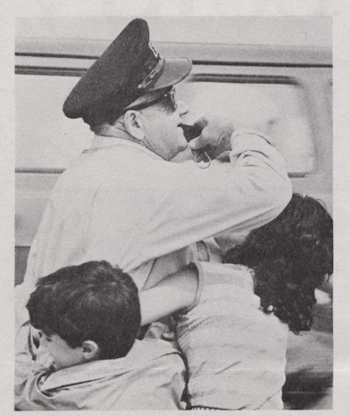
Children must be considered when laws are being reviewed and enacted.

quired a great deal of research knowledge about the interaction of children and the contexts in which they live. This knowledge has not only made institutional change imperative, it has also given us clear guidelines as to how to go about it. In certain instances this has already happened. Thus, for example, findings about attachment and separation with respect to children and their families have been taken into account by designers of new health care settings and services. But all our institutions that profoundly affect the lives of children such as education, the child welfare system, the courts, municipal and community services, must change to accommodate the social revolution that is still in process and the new knowledge we possess if Canada's children are to develop in ways that will benefit themselves and society as a whole.