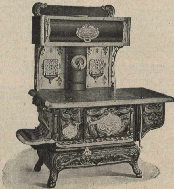
This is the First Prize for the Three Best Recipes received. At the option of the winner we will award a McClary Pandora, a McClary Combination Gas and Coal Range, or a Steel Range—which ever is most suitable for the winner's requirements.

Every contributor of a set of recipes duly qualified for publication in EVERYWOMAN'S WORLD can receive as a special reward a handsome Royal Rochester Casserole, value $3.00. This fine award is in addition to any prizes your recipes may win.