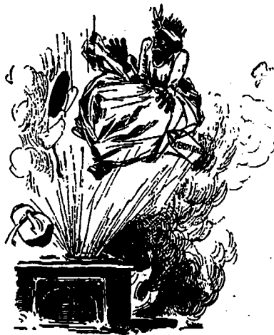
THE HIGHERED GIRL.