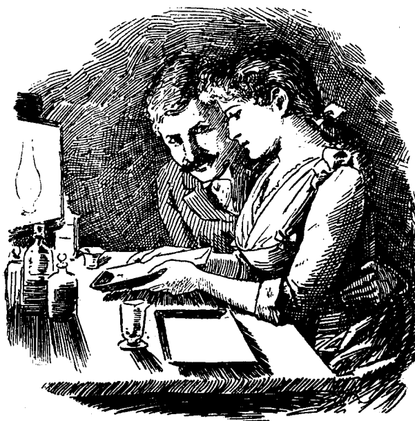
His hopes are high, but ah! she's developing a negative!