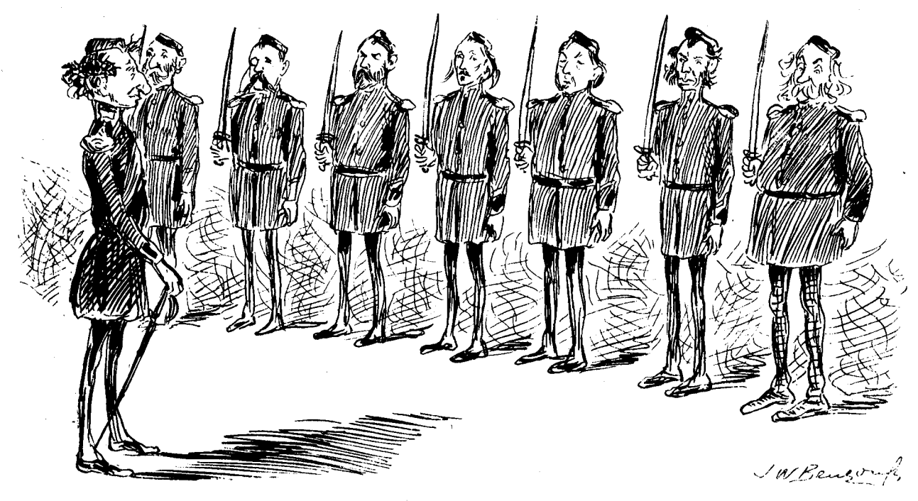
THE BEST DRILLED COMPANY ON EARTH.