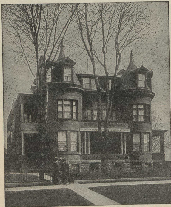
WESTMINSTER COLLEGE, TORONTO