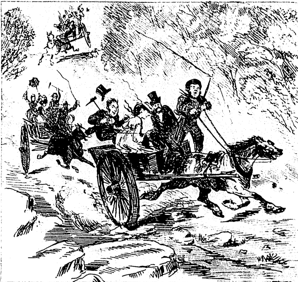
"And when they next do ride abroad, may I be there to see"

The descent from Montarville.—One step from the Sublime to the Ridiculous.