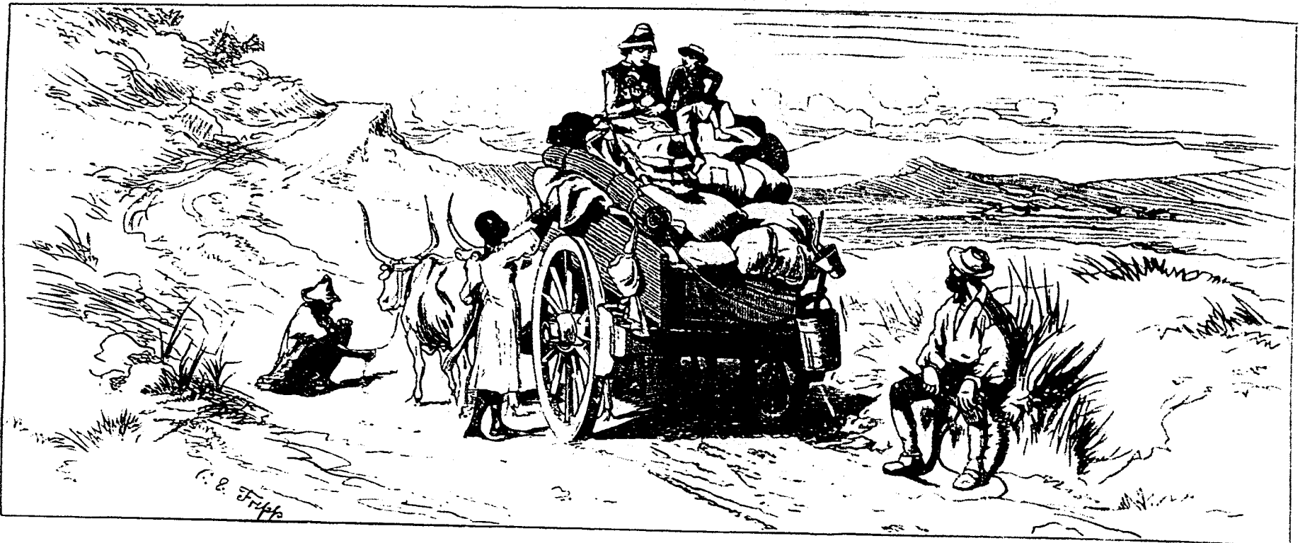
AN EMIGRANT TRAIN IN THE TRANSVAAL.