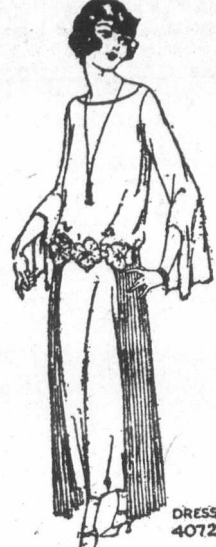
PATTERN & DESIGN is provided for the BUTTERICK DESIGN including Pattern and Instructions for making Flowers