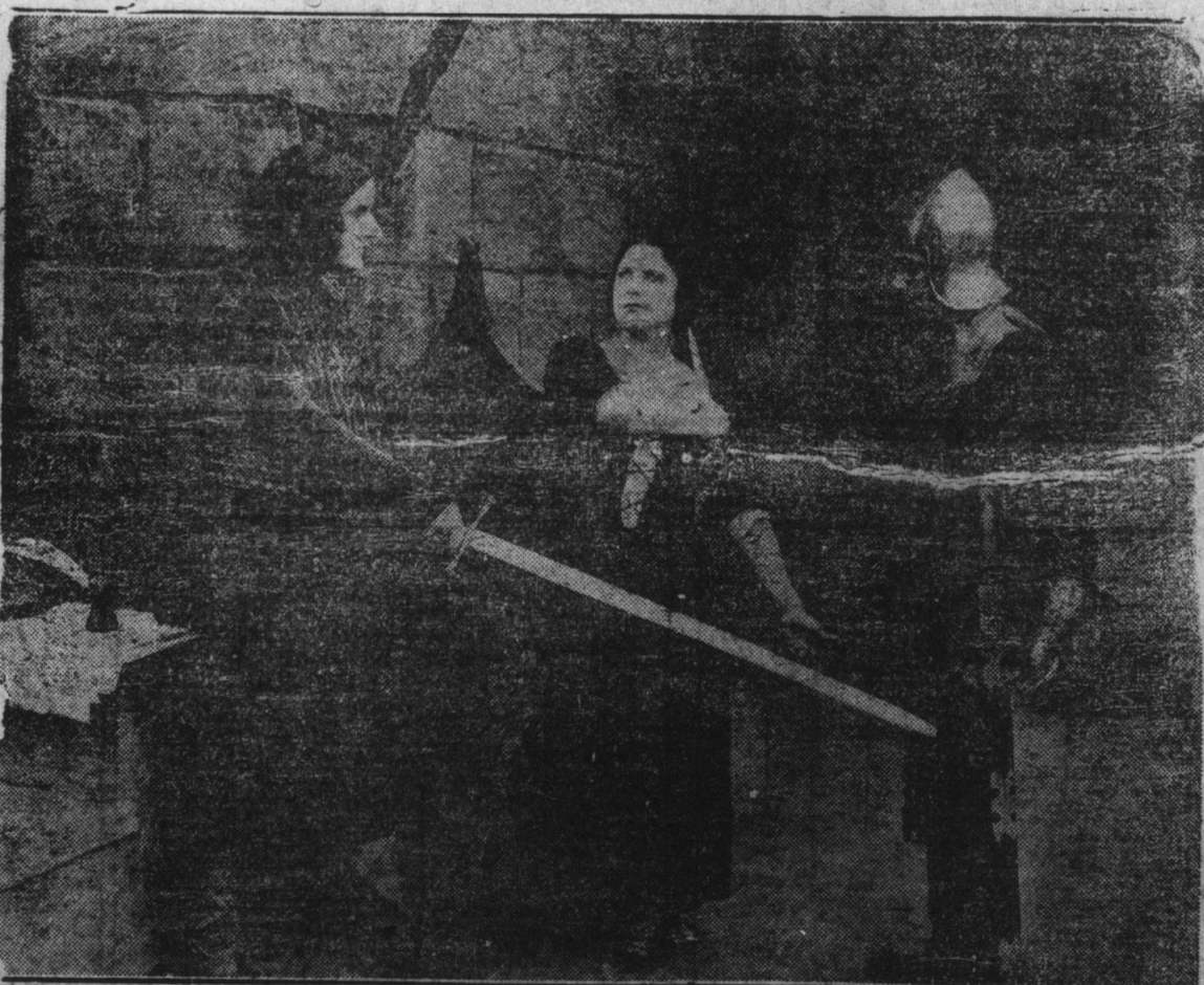
JOAN BREAKS THE GOVERNOR'S SWORD WITH A DAGGER.

JESSIE L. LASKY presents CECIL B. DEMILLE'S Historical Cinema Masterpiece, GERALDINE FARRAR in "JOAN THE WOMAN." Based on the life of the immortal JOAN OF ARC.