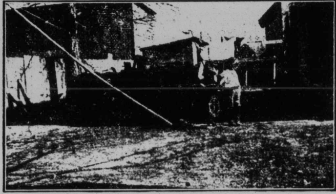
A backyard scene which is anything but attractive and bemelike.

Within the few weeks, the workman said that, while paying 60 time will be opportune for making cents per week additional rental, he home gardens out of even the most costly actually saving 12 cents.