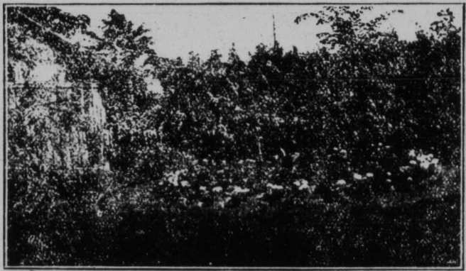
Surroundings like these lend enchantment to the home and encourage industry

The appearance of his surroundings is usually an index to a man's The work of the garden created an character. The planting and care of interest in the home, and an in a garden has also an influence for fluence for good in the lives of those good, as well as a sentimental effect directly responsible as well as those in the home, which cannot be meas-of the neighborhood.