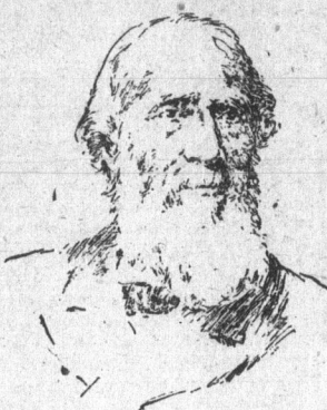
SIR GEORGE WILLIAMS.