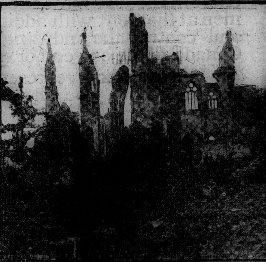
Scene on the Western Front.—A view of a destroyed cathedral in Ypres.