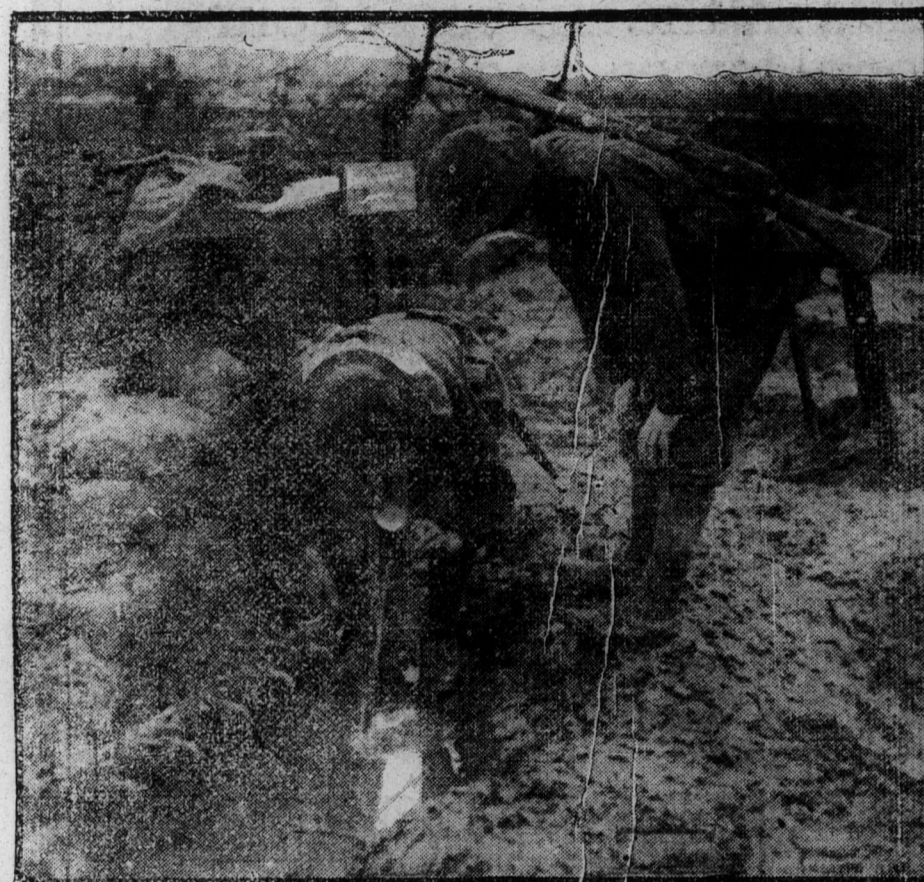
Two men of the Coldstream Guards having a drink from a forward water supply.