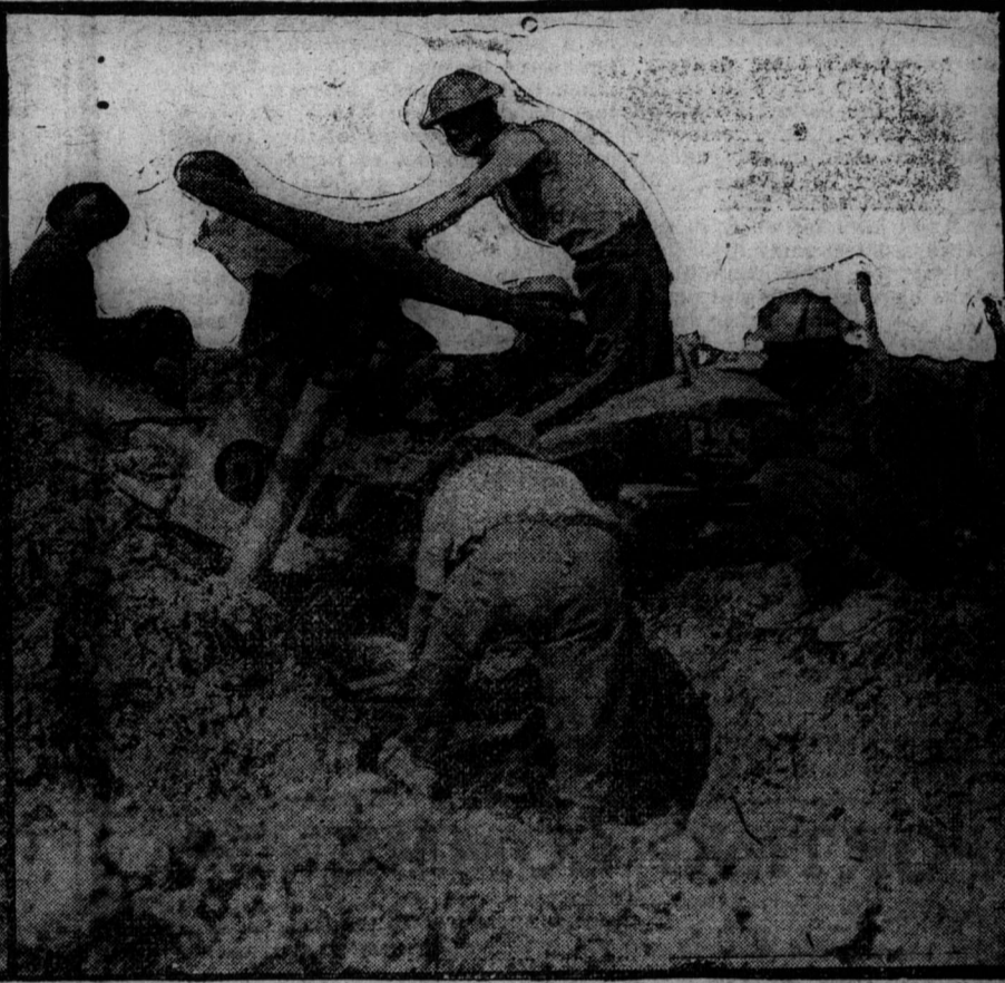
Near Euvel—Digging out a German gun that was smashed by the fire of our guns.