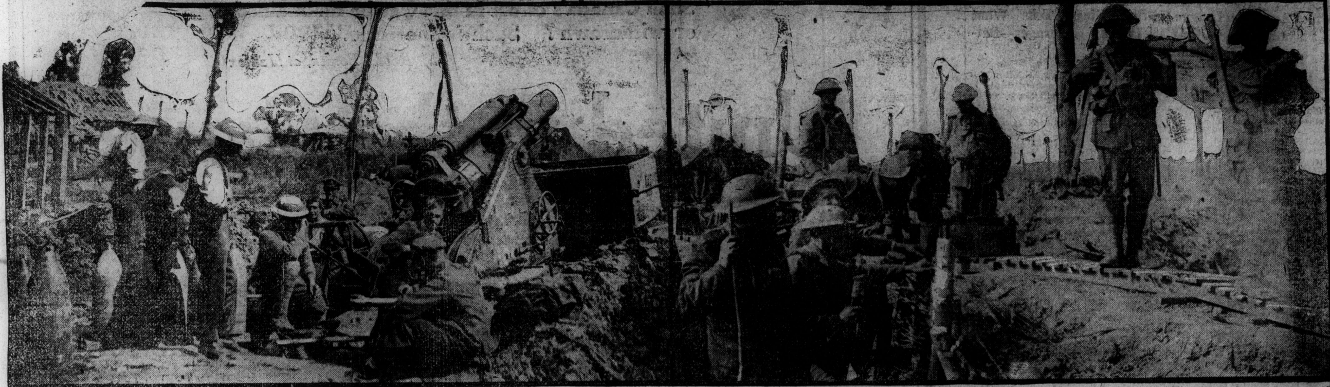
A brief spell during the bombardment of Zonnebeke.