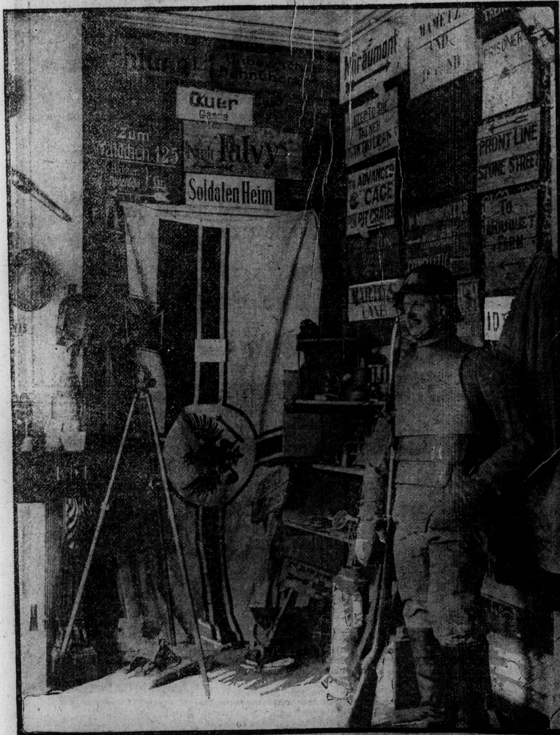
War Trophies.—Corner of museum on western front, showing dummy in German armour of polished steel and German flag from Peronne.