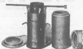
Moulds and the Tile they make.