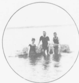
A SUN BATH.