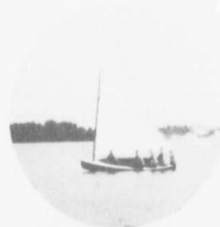
YACHTING ON THE BAY.

The whole property abounds in shady nooks where the brain fagged man can recuperate and rebuild, and the Peninsular always assures calm water no matter which way the wind is blowing. Bathing is absolutely safe, as is the boating, and the intending visitor can thus free his mind from all thoughts of distressing accidents on the water, such as are common to so many summer resorts.