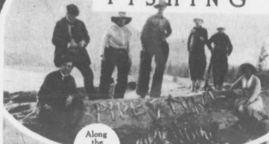
Along the Pipestone River