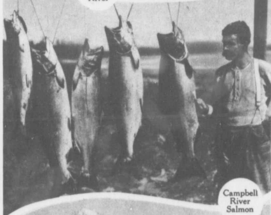
Campbell River Salmon