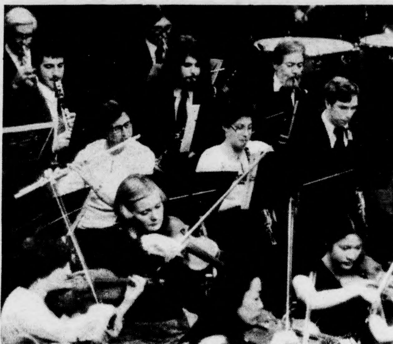
Community and University play together in CCO