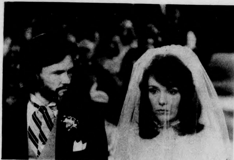
Shake Tiller (Kris Kristofferson) and Barbara Jane Bookman (Jill Clayburgh) go to the altar in Semi-Tough .

In the wrong hands most of this type of material would be disastrous. Ritchie, however, has a light and subtle touch and a talent for getting the most out of both his actors and the script. Bernstein's screenplay, although lacking in flow and overall dramatic and comedic continuity, is so polished in its individual scenes that the bumpy transitions are rarely noticeable.