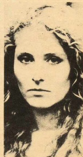
Nostalgia plays at Wormwoods Sept. 29

Show of Four Local Women Artists , Manuge Galleries, 1674 Hollis, 9:30-5:30 M to F, 10-4 Sat. The show will run through October.