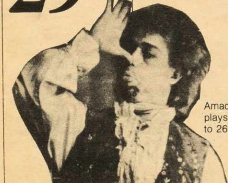
Amadeus plays Sept. 20 to 26