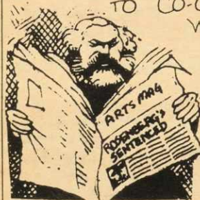
Next Arts Mag Oct. 3

ah yes... 'OBJECTIVE JOURNALISM' indeed. the bourgeois press IS 'free'... FREE TO CO-OPERATE WITH THE FBI!