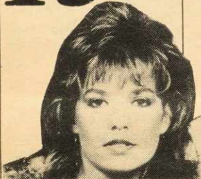
Spoons play Halifax this month.