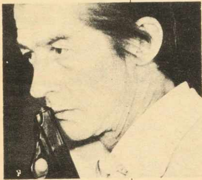
The Hit starts Sept. 6 at Wormwoods