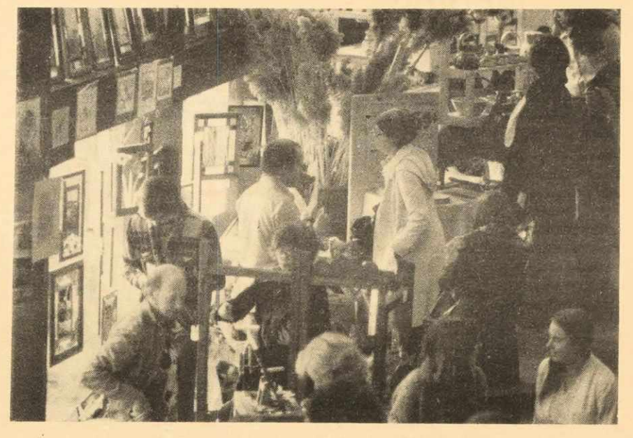
The sculpture court at the Arts Centre was mobbed all weekend for the Crafts show.