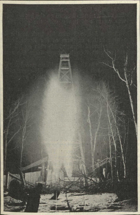
Two Gas Wells Burning at Night.

fences gird many a prairie homestead. Moncton's cotton have garbed the girls of Goderich. Its many other industries have made Moncton known and respected from East to West. Just recently, English capital took over the electric light and gas plants and established a street railway system and are offering electric and gas power, heating and lighting to manufacturers at nominal prices. The development of the oil and shale fields is bringing a lot of money into the town, and a number of manufacturers contemplate Moncton as a centre for their activities.