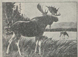
EXCELLENT RESULTS ARE OBTAINED WITH DOMINION HIGH VELOCITY RIFLE CARTRIDGES DOMINION CARTRIDGE COMPANY LIMITED