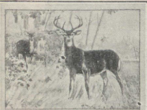
DOMINION 30-30 AMMUNITION GIVES COMPLETE CONFIDENCE TO THE HUNTER