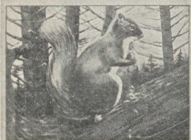
DOMINION AMMUNITION EVEN IN SMALL GUILDS