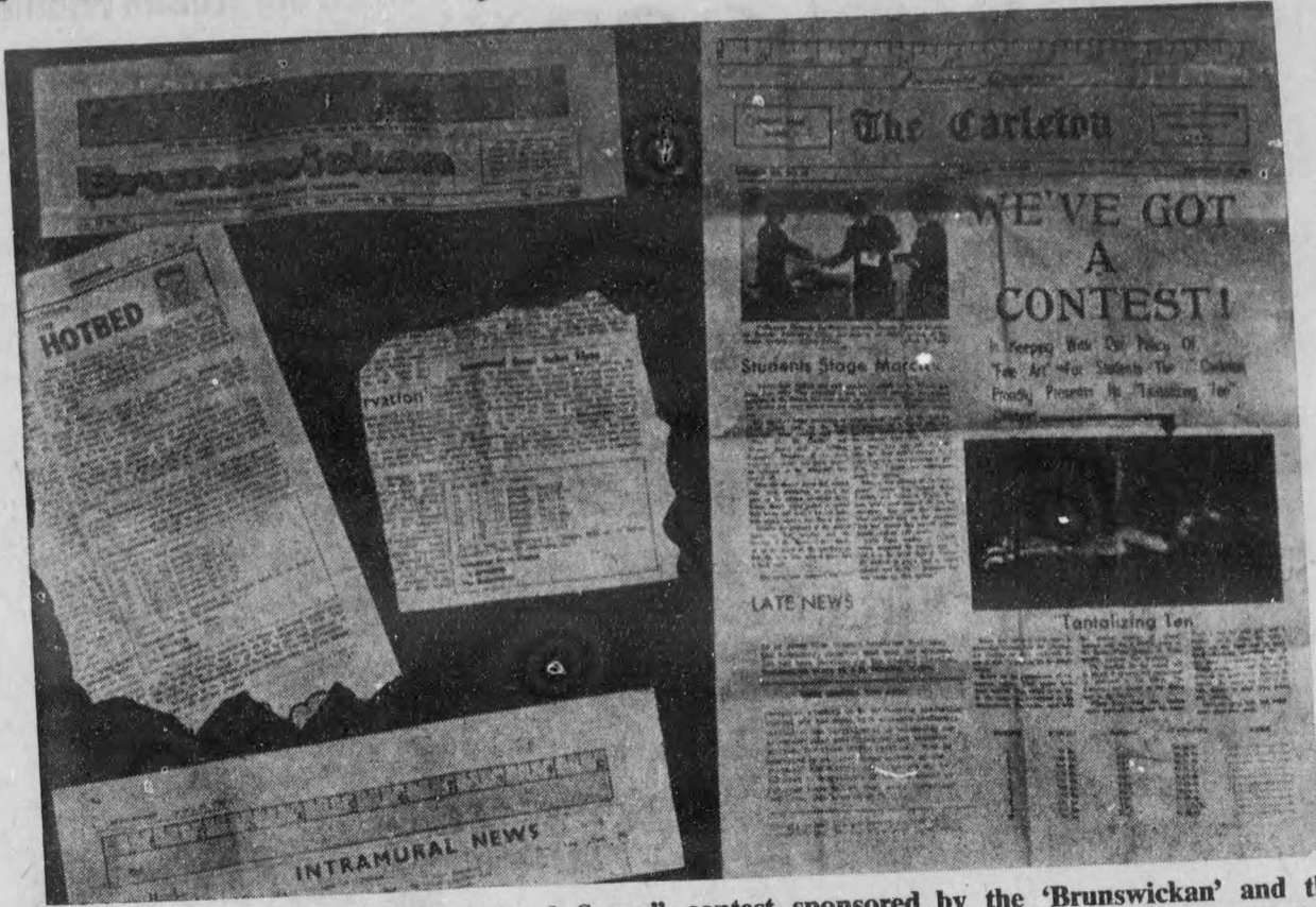
The similarity of the "Sensational Seven" contest sponsored by the 'Brunswickan' and the "Tantalizing Ten" competition appearing in the 'Carleton' a month afterward can be clearly seen in the comparison between clips of the two papers. The 'Carleton' drew reader attention to their contest by publishing a three column picture of a nude and included a ruler appropriately labelled a "figurematic calculator".

FREDERICTON — A silence of guilt rested squarely on the shoulders of the Carleton , the student newspaper, at Carleton University, Ottawa, as the final issue of the Brunswickan of the college year was being readied for the printer, Wednesday night.