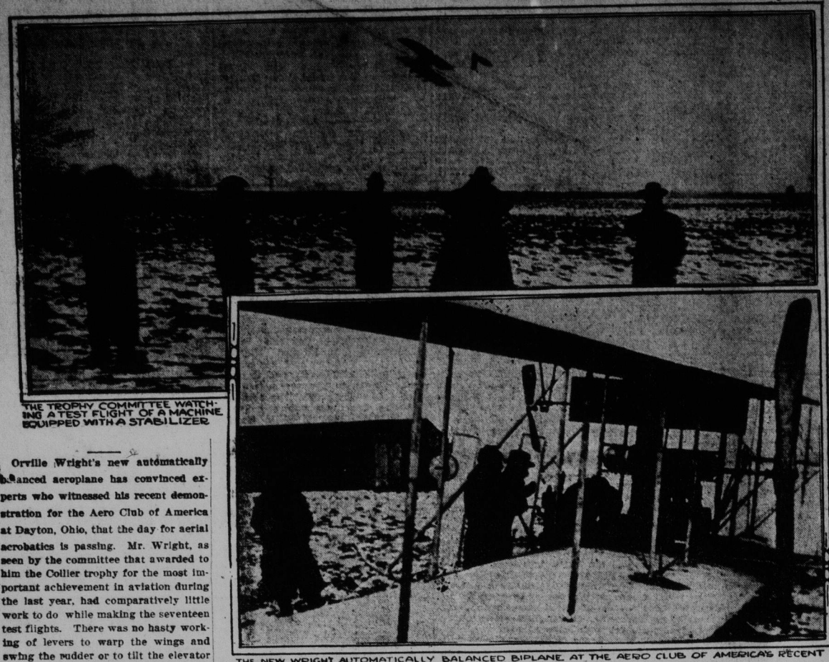
THE NEW WRIGHT AUTOMATICALLY-BALANCING BIPLANE AT THE AERO CLUB OF AMERICA'S RECENT TEST