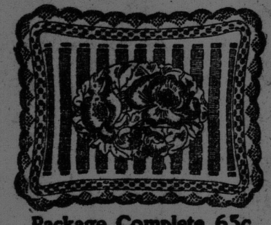
Package Complete 65c.

These fancy work outfits are shown in a charming line of Pillows, Bibs, Fancy Bags and other novelties. Also in Shirt Waists, Bouses, Scarfs, Dressing Sacques, Children's Dresses, Etc. in other designs.