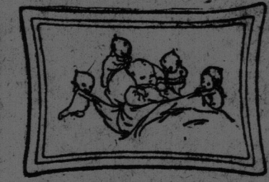
CRIS COVER 95c COMPLETE PILLOW COVER 55c COMPLETE

The Royal Society packages everything needed, material sufficient, Embroidery Floss and complete instructions for making. You will be surprised with the charming brilliant results of your needlework if you learn the many advantages of Embroidery Floss. It may be had in white and fast colors in a large variety of sizes suitable for all forms of needlework.