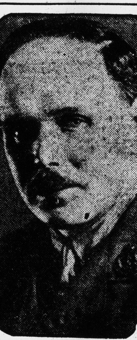
Viscount Willingdon, who has recently arrived in Quebec from England, may be appointed governor-general of Canada to succeed Baron Byng.