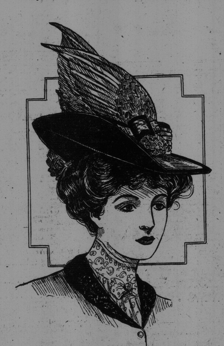
STREET HAT FOR YOUNG GIRL.

The drawing shows a hat of black felt, trimmed with Alice blue velvet and wings. The shape was pointed in front, and rolled up on the left side, the under brim at the back being filled in with platings of black tulle. The top of the brim was faced with the Alice blue game velvet, to within an inch of the edge, the rather high black felt crown being banded with folds of the velvet. At the left side of the front a black feather buckle was placed, through which a few loops of two-inch wide gold braid was slipped, the buckle ostensibly holding in place three curved wings of Alice blue, to match the velvet used in trimming.