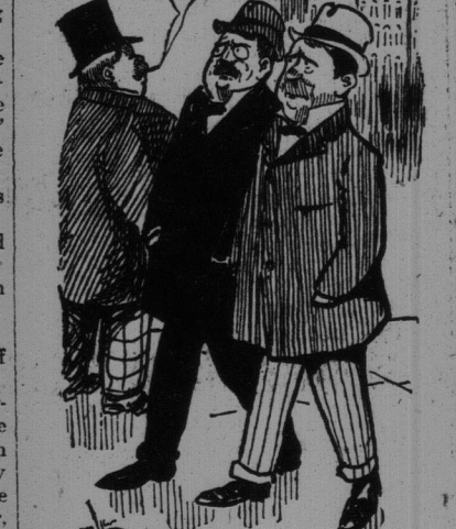
THERE ARE OTHERS.