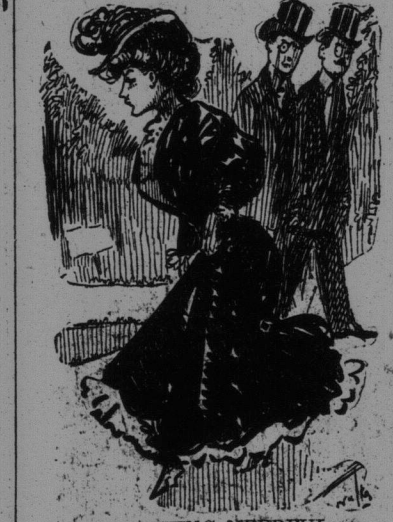
ONE THING NEEDFUL.

The Map Publisher—Better wait 20 minutes. They might start a revolution.