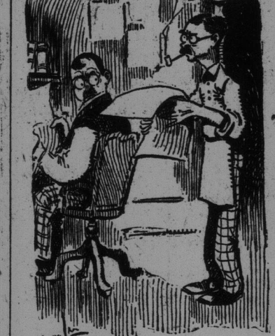
THE WAY THEY DO.

Mrs. Koyns (handing him his bill)—Very true. You can't sign a check with a sword.