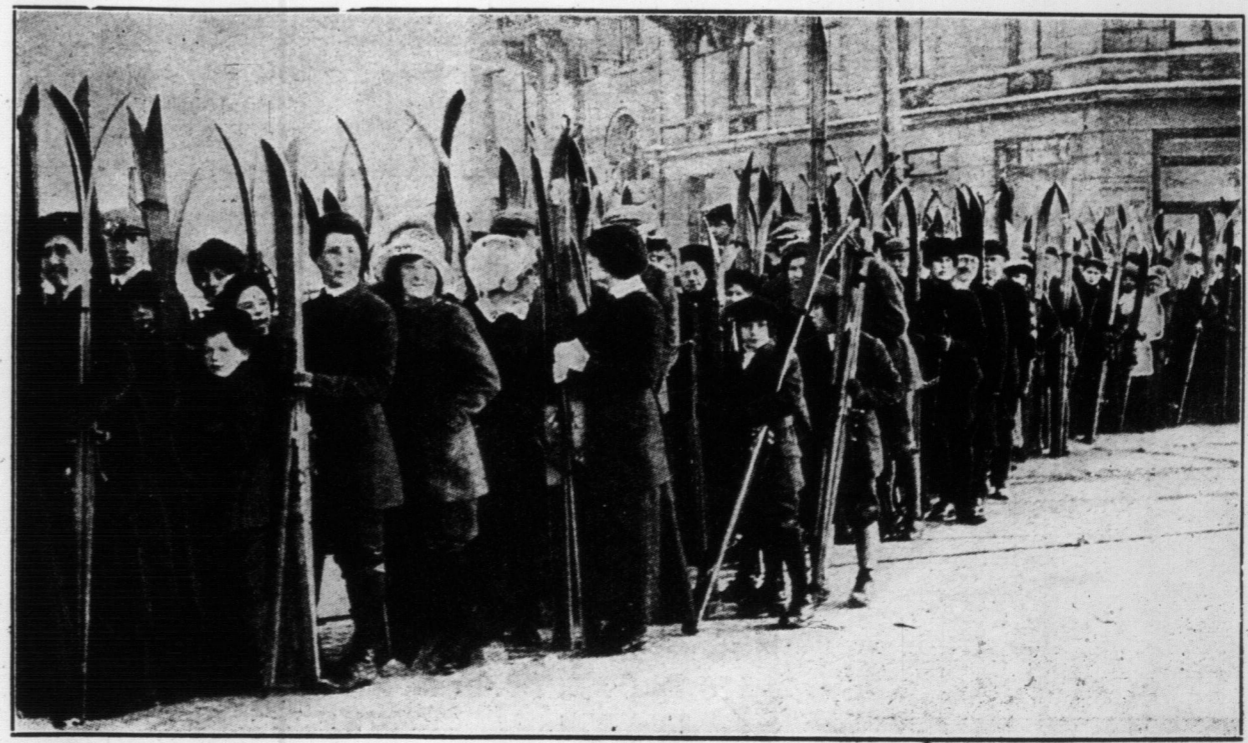
EXODUS FROM CHRISTIANIA, NORWAY, TO THE SUBURB OF HOLMENHOLEN, ON A WINTER SUNDAY, WHEN THE WEATHER CONDITIONS PROMISE A GOOD DAY'S SPORT.