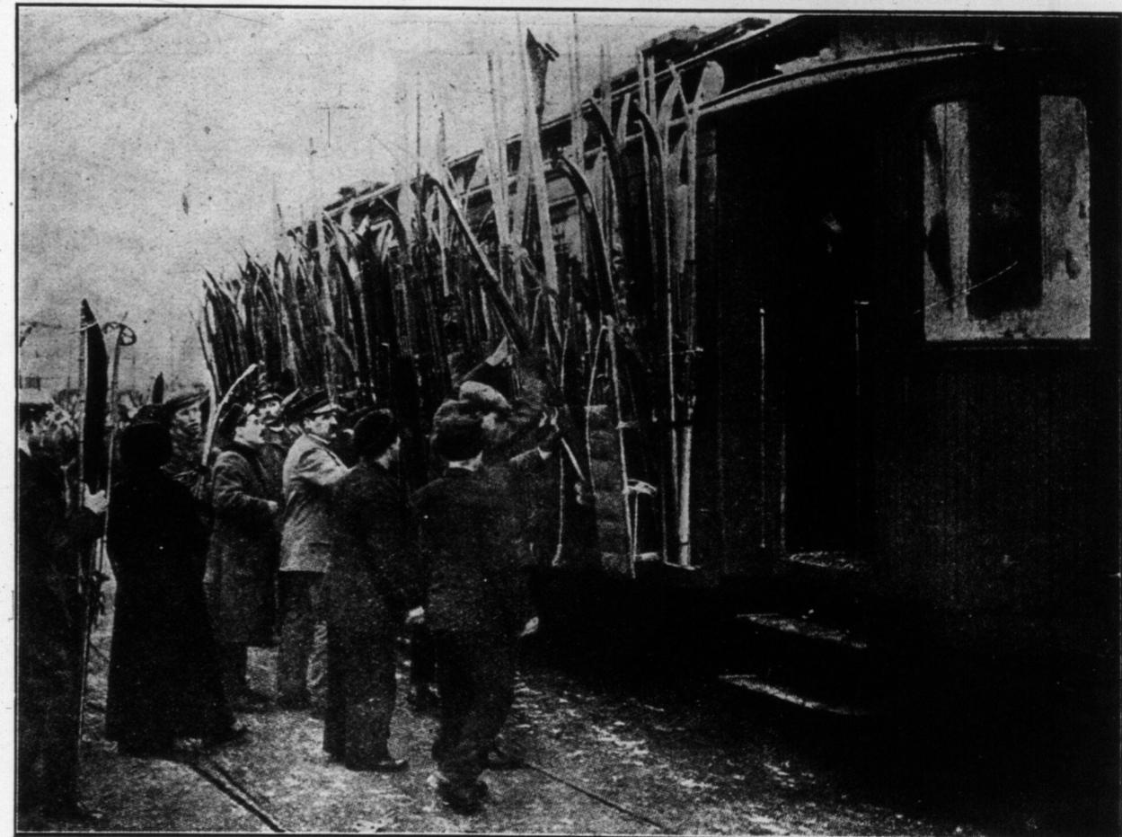
WHY NORWAY WAS FIRST AT THE SOUTH POLE. SKI-RUNNERS LEAVING CHRISTIANIA FOR A DAY'S SNOW SPORT.