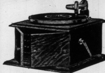
Victor-Victrola IV, $20.

The Victor-Victrola will bring your kind of music right into your home.