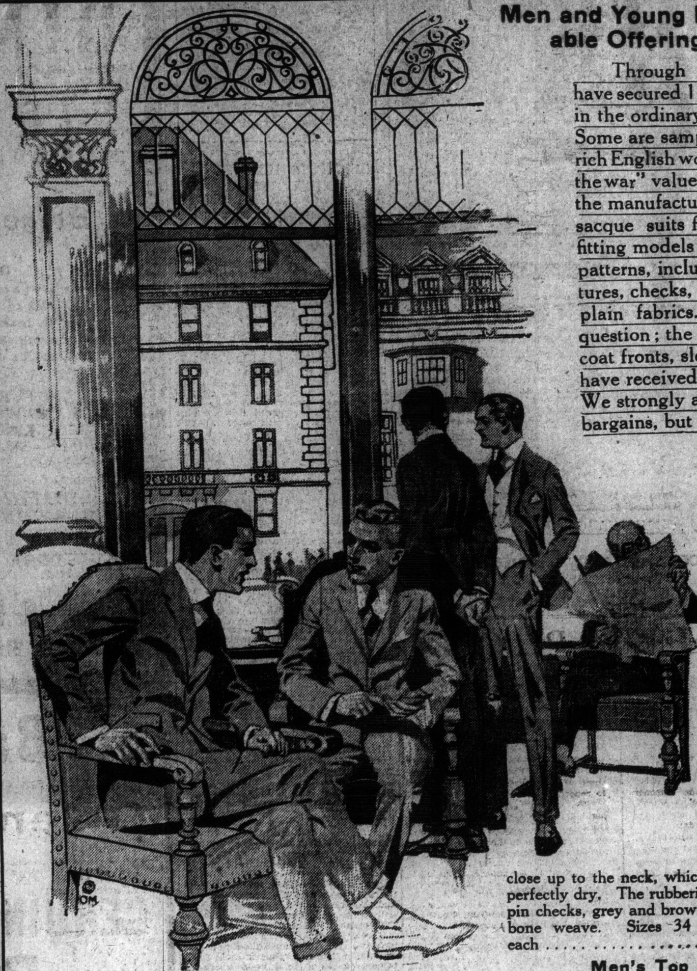
Young Men's Suits, $18.00

Creamed Lobster in Pattie; Toast or Tea Biscuits; Neopolitan Ice Cream; Pot of Tea or Coffee ..... 20