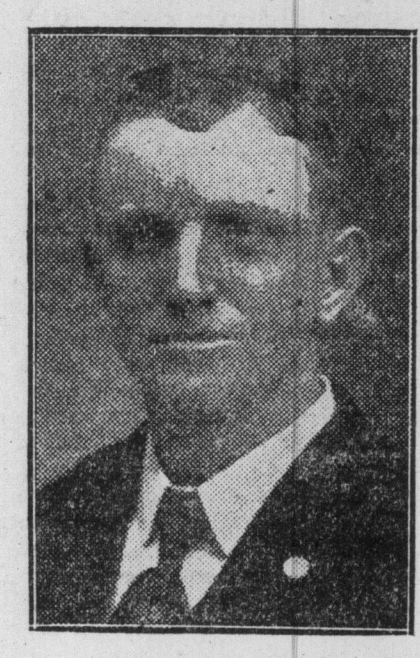
General Secretary-Treasurer Interna-onal Brotherhood of Blacksmiths and

of these zealous representatives of the toilers. Resolutions have been submitapart as the one from the tailors that work be not taken home, and, on the other hand, that a political movement ntary party be inaugurated.