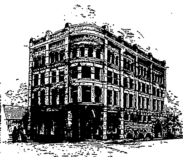
HUDSON'S BAY STORES, VANCOUVER

man, for a year, is also given. Another part of the folder gives cuts of the company's stores at Winnipeg, Vancouver and Calgary. In addition to these stores, it is hardly necessary to state here that the company has stores and supply depots at, we may say,