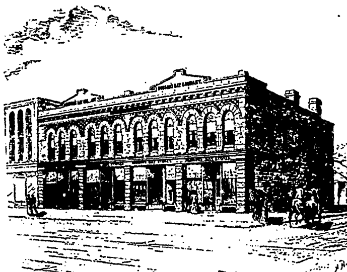
HUDSON'S BAY STORES, CALGARY

The Hudson's Bay company has been handling the trade of the great north country for over 200 years. Their trading posts dot the country