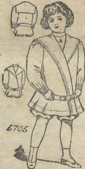
NO. 5705.—LITTLE BOYS' SUIT.

Where more than one pattern is wanted, additional coupons may be readily made after the model below on a separate slip of paper, and attached to the proper illustration.