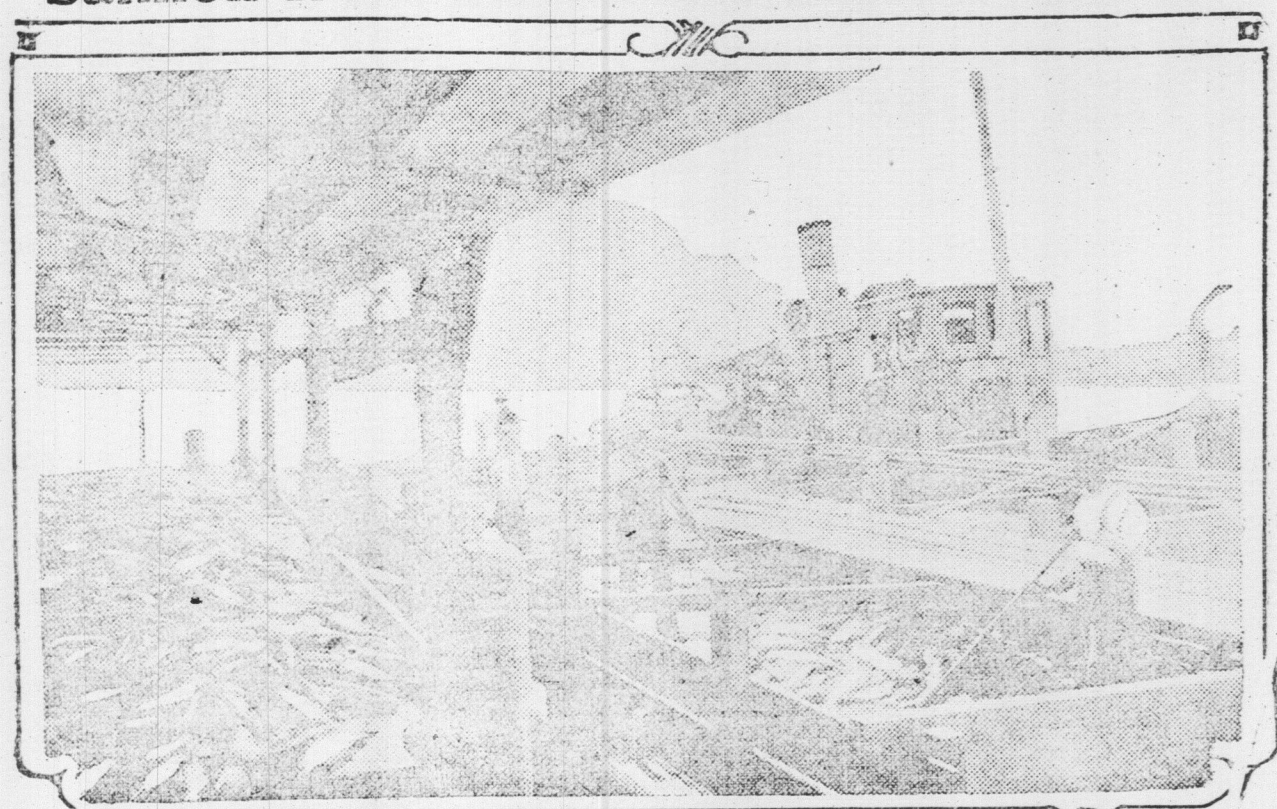
Unloading Salmon from Stows, Westminster, British Columbia.

There are salmon and salmon, but the finest specimens of this sporting fish come from the waters of British Columbia. There is a variety of salmon on the Atlantic coast which is highly prized as a delicacy, but the supply is very limited; the catch on the Pacific coast is about thirty times as large and also very fine in size and quality.