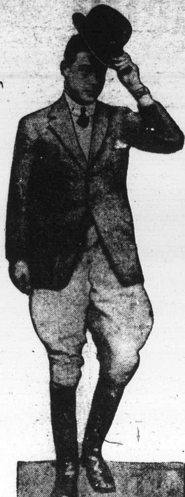
H.R.H. the Prince of Wales ready for the hunt at his recent visit to Toronto.

A despatch from Ottawa says:—The usual Armistice Day two-minute silence will be observed on Tuesday, Nov. 11th, at 11 o'clock, throughout the British Empire. This is in addition to the observance of Armistice Day and Thanksgiving Day on Monday, Nov. 10th.