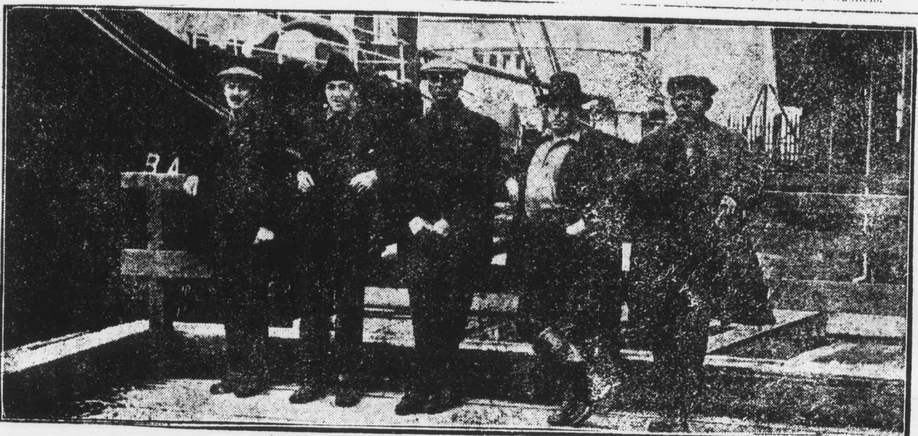
Here is part of the crew of the ill-fated Hudson's Bay Company ship Lady Kindersley, which went to the bottom of the northern seas with her million-dollar cargo of furs. The men made a perilous dash over dangerous ice floes to open seas and were picked up by another vessel.

The Alberta wheat pool has a membership of 30,000 farmers. The trustees claim that the pool has resulted in a five cent bushel advantage to the farmers in the last year, the total being 20,000,000 bushels.