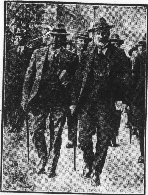
Mr. Ramsay MacDonald, accompanied by Mr. J. H. Thomas, colonial secretary, is shown arriving at the House of Commons to deliver his speech on the Irish boundary question.