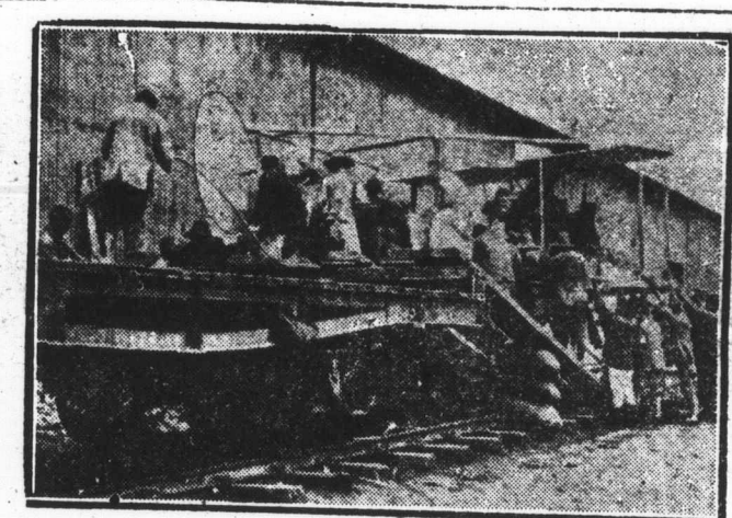
This photograph from the Chinese war zone shows airplanes being unloaded at Nanking. By a queer coincidence, the plane shown here was wrecked the day after the picture was taken, killing two of the few Chinese