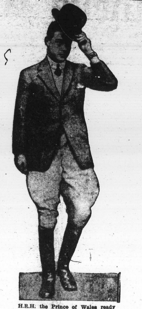
H.R.H. the Prince of Wales ready for the hunt at his recent visit to

"One of the things for which Cantenance of open communication be-tween the capital (Pekin) and the sea." The War Oct 18 Persistence of the main-tenance of open communication be-the has established a system of educa-tion that compares favorably with any in the world. Canada is a nation of Hong Kong, Oct. 16.—Foreign mis-literates, she has a remarkably small