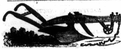
Agricultural and Garden Implements.