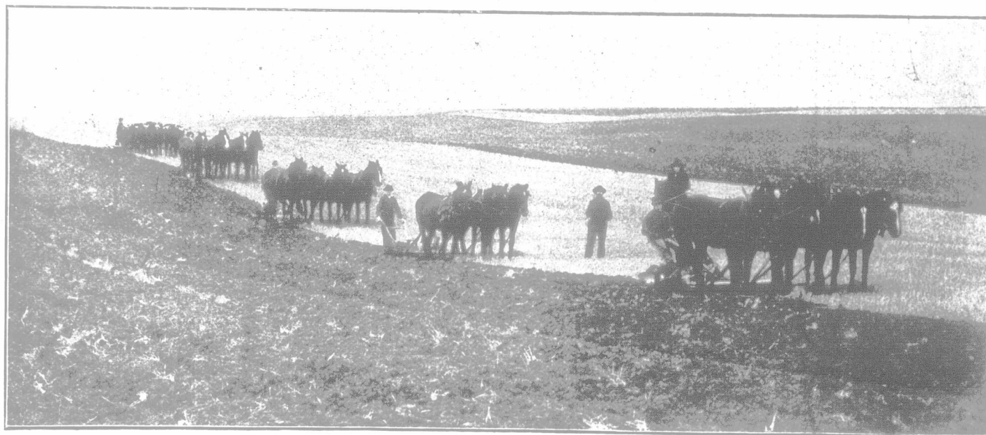
STUBBLE PLOWING IN MANITOBA.

The Canadian Pacific Railway Company have 14,000,000 acres of choice farming lands for sale in Manitoba, Assiniboia, Saskatchewan and Alberta. Manitoba lands and Assiniboia lands east of third meridian, $4 to $10 per acre. Lands west of third meridian, $3.50 to $7 per acre.