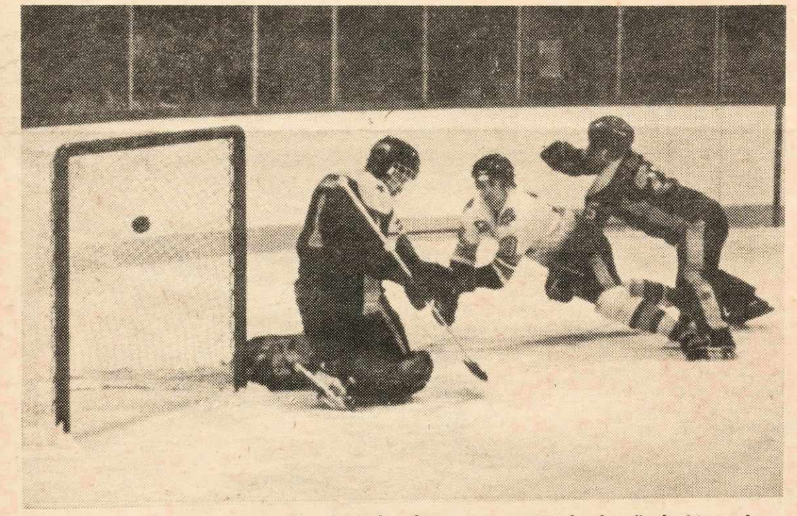
The expectation is already growing for the Dal-U de Moncton AUAA hockey finals this week.

5163 South St. opposite Hotel Nova Scotian 423-7089 422-3946