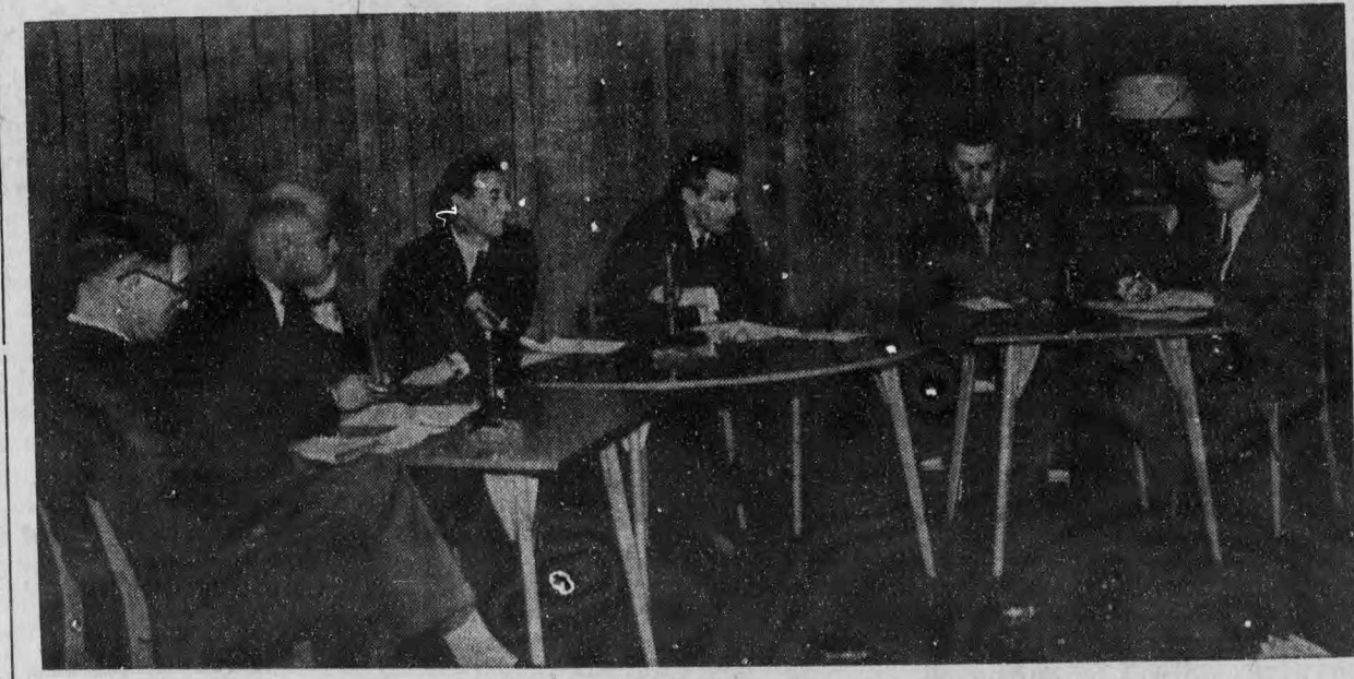
Members of the panel who discussed "The Future of U.N.B."

Drama Society Meeting This evening in the All-Purpose Room of The Students' Centre 7:30 P.M.