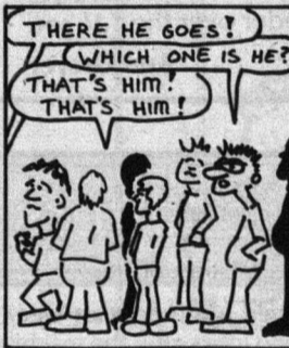
The Comic Zone

SUBMISSIONS MAY BE DROPPED OFF/PICKED UP AT THE GATEWAY PHOTO OFFICE SUB 236.