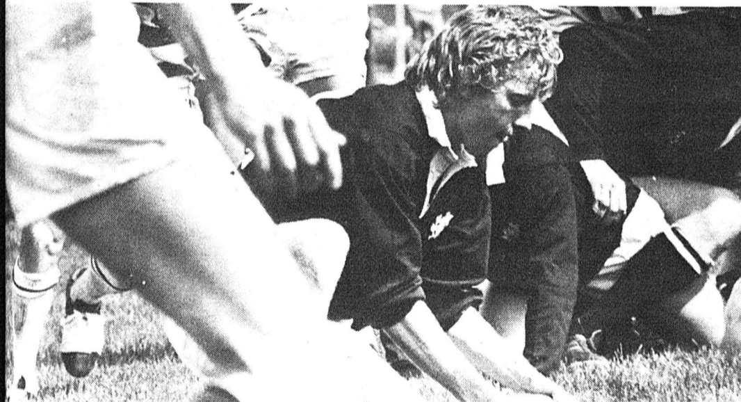
Spring training... The U of A rugby club will be holding a film night, March 10 at 7:30 p.m. in the party room at Edmonton House, spring training begins March 15.