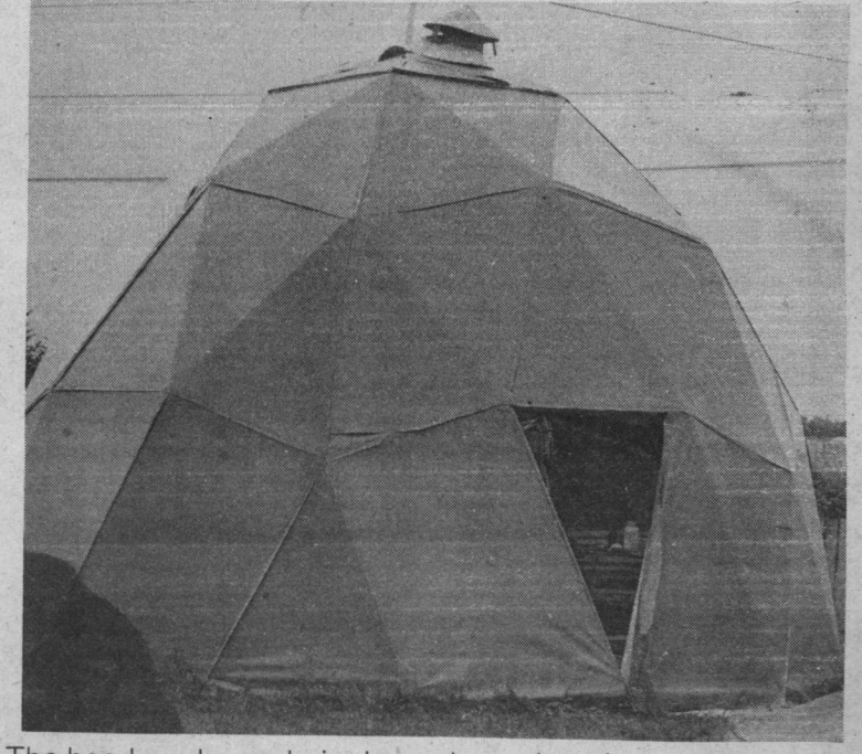
The hand-made geodesic dome shown here is used to house a pottery kiln. City officials have ordered the destruction of the dome; the kiln is now for sale.

Watch Footnotes, the S.L.A. will be meeting on campus again