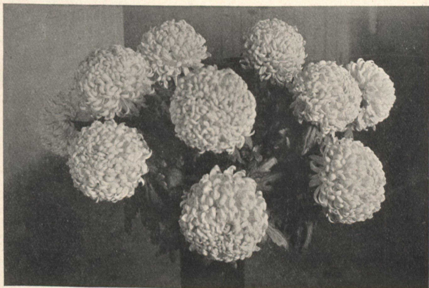
In the Month of 'Mums.—The President Roosevelt Chrysanthemum.