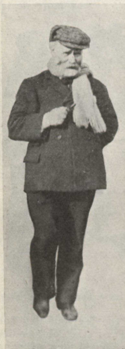
J. KEIR HARDIE, M.P., who wants a Socialist elected President of the United States.

ENGLAND is laughing at a subtle, humorous jibe at Mr. Bonar Law made by Mr. Ramsay Macdonald, the leader of the Labourites in the British House of Commons. Mr. Macdonald in referring to the Unionist Chief's rather violent speech at Blenheim Castle, which evoked the famous epistolary retort of Winston Churchill, remarked that Mr. Law should have delivered his speech on Tower Hill, the recent scene of the labour hysteria of Ben Tillett.