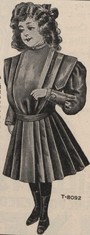
T-8092. Girl's School Dress, made of all-wool Serge; front and back of waist has two wide side pleats on either side; shoulder pieces of self give broad effect; collar and deep cuffs trimmed with fancy silk braid; full kilted skirt; finished with belt. Lined throughout. Colors navy, red or brown. Special low prices. Sizes