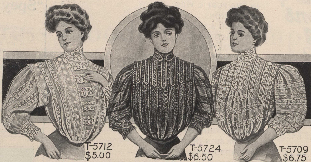
T-5712. Waist, of fine Bretonne Net, made over separate slip of Japanese silk; front beautifully trimmed with Val. lace insertion and lace edging, also has wide insert of embroidered net on either side extending over shoulder and down back; fastened in back. Choice of white or ecru..... 5.00 If by mail, postage extra 15c.

Not for many a day have you been privileged to obtain so much for your money in a beautiful waist. When you read the description below you will surely have a desire to obtain one or more of these for yourself. The price asked is small when you consider the quality of material and the amount of labor required to cut, stitch, trim, fit, get in all the tucks, put on strappings; buttons, and perform all the other odds and ends that go to the making of a stylish waist.