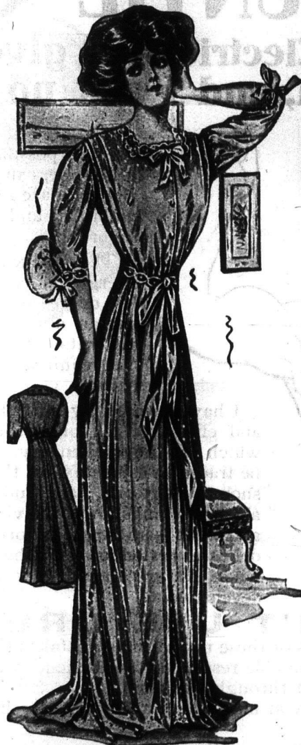
ONE PATTERN 6395—Sizes 34—44

Graceful negligees are always in demand. This one is charmingly attractive yet perfectly simply withal. It can be made either in the length illustrated or shorter as liked, it is open all the way down the front and it is adapted to challis, cashmere, India silk and all materials that are used for negligees. The blouse portion is