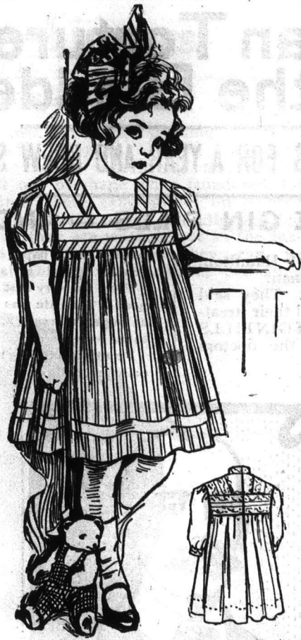
DESIGN BY MAY MANTON. 6428 Child's Dress. ONE PATTERN 6428—Sizes 2—6

For a child four years of age 2½ yards of material 24 inches wide, 7½ yards 32 or 1½ yards of 44 inches wide, with 1½ yards of banding; or 1½ yards of flouncing 20 inches wide; with one yard of plain material 36 inches wide for the sleeves and 1½ yards of banding. A May Manton pattern, No. 6428, sizes 2, 4 and 6 years will be mailed to any address by the fashion Department of this paper on receipt of ten cents. (If in haste send an additional two cent stamp for letter postage which insures more prompt delivery).