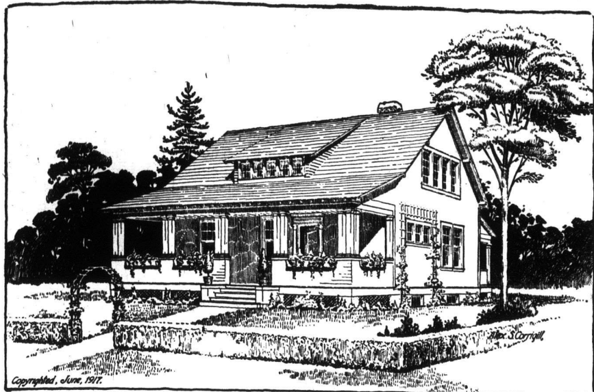
MANITOBA AGRICULTURAL COLLEGE, FARM HOUSE "B", 28½ x 35'