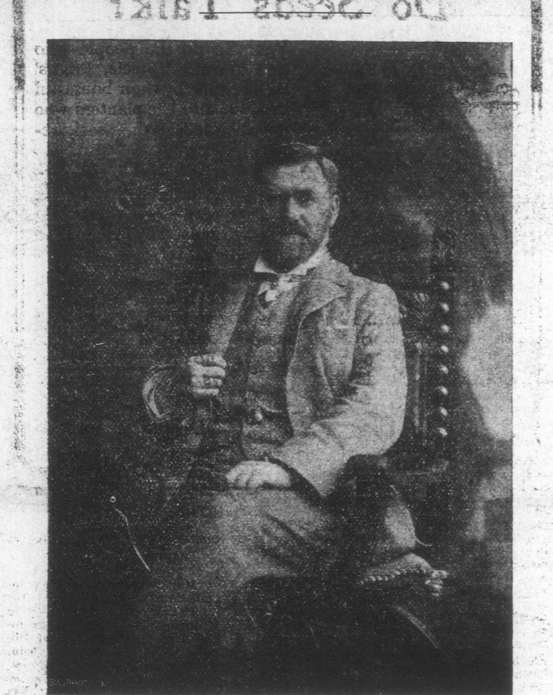
HON. J. S. DUNSMUIR, PREMIER, South Nanaimo.