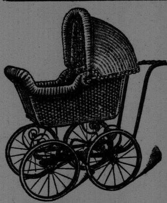
This 1916 Carriage only $27.90

H. N. DeMILLE & CO. 199 to 201 Union St. - Opera House Block